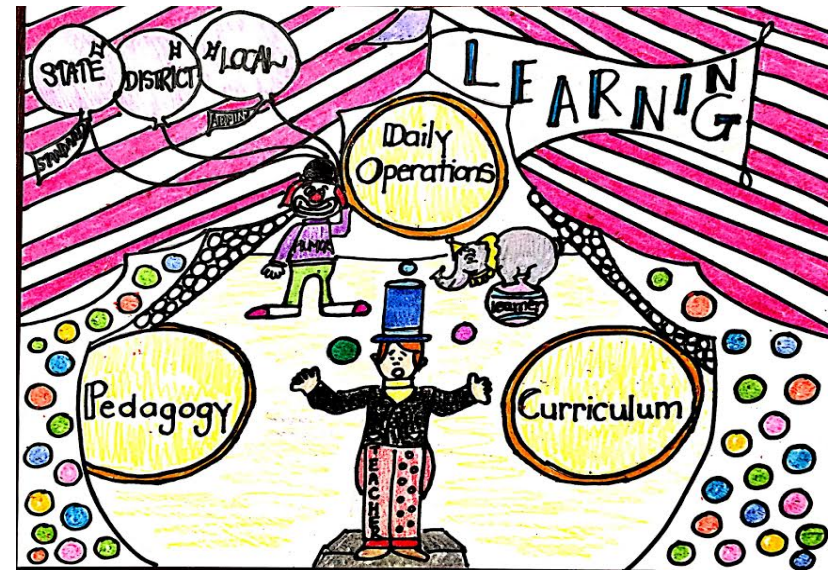
Figure 1. Pictorial metaphor example, Under the Big Top: Learning is a Circus.

The Basic Coding, or Features Checklist, was taken to the next level by coding the drawings at a higher level of abstraction. Known as Trait Coding (Haney et al., 2003, p. 253), the two co-researchers and student assistant returned to the drawings to rate them according to the extent to which a certain trait was portrayed (i.e., "what did we see?"). Again, coding results for all three raters were compared and new categories were added as appropriate (Table 2).